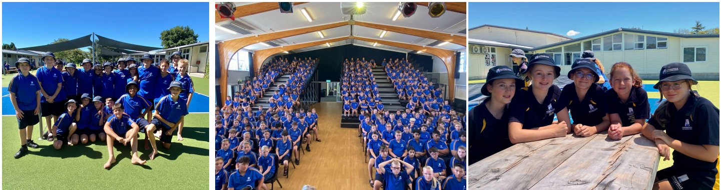
Students enjoying catching up during break times and our first full school assembly for 2024