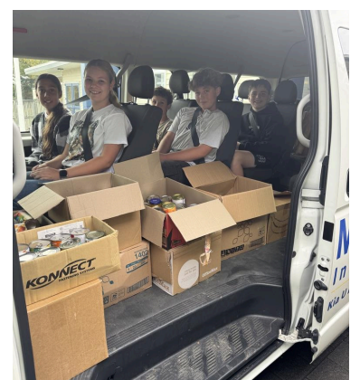
Student Execs sorting and delivering the food bank donations